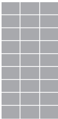
3 x 9 27 CELLS