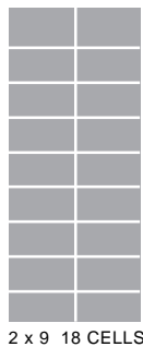
2 x 9 18 CELLS